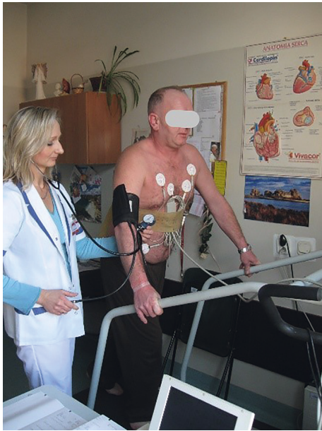
FIGURE 2: Exercise test on the treadmill with blood pressure (CTK), heart rate (CAS), and ECG monitoring.

national health services. At the same time, rehabilitation of patients with PAD in many countries is not eligible for refund.