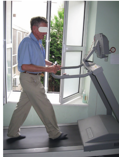
FIGURE 1: Treatment of claudication: treadmill training.

risk of injuries or complications. The mechanism underlying the increasing walking distance in patients with intermittent claudication following exercise therapy is not clear. This effect is not based on one mechanism but results from a combination of many factors. Authors of many publications emphasize that treadmill walking causes beneficial rheological changes, causing increased deformability of erythrocytes and decreased blood viscosity. It also leads to morphological changes in muscle fibers, thanks to the improved capillary flow. Finally, training changes the perception of pain through increased supply of endorphins, leads to so-called “walking economy” improvement, and importantly causes pleiotropic changes in metabolism [25–27].